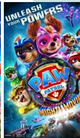
Paw Patrol: The Mighty Movie