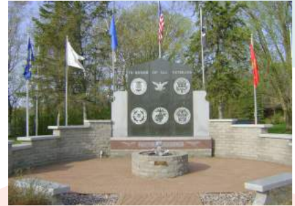
Blue Star Park Memorial