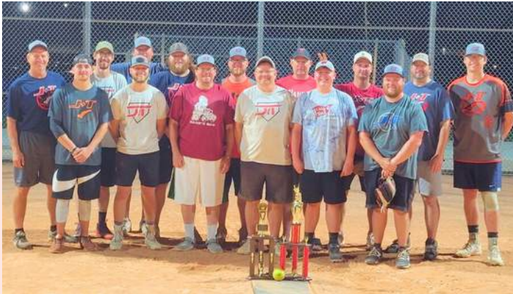
2023 Men's League Champions- J&T Auto

Season Dates: Mid-May through Mid-August