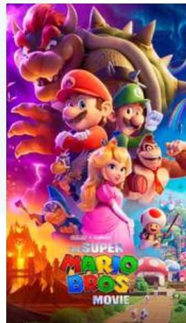
Super Mario Bros Movie